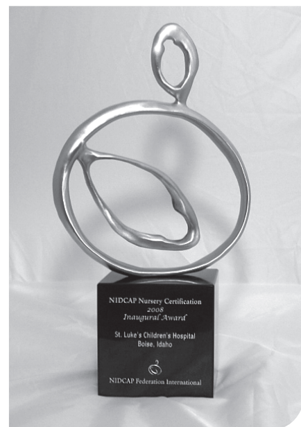
The Newborn Intensive Care Nursery at St. Luke's Children's Hospital, Boise, Idaho is the first to have earned the NFI certification as a NIDCAP Nursery. The certification ceremony took place on December 9, 2008.

The NIDCAP Nursery Certification Program (NNCP), under the auspices of the NFI, seeks to recognize a hospital nursery's commitment to, and integration of, the principles of NIDCAP for infants and their families. Nurseries eligible for consideration must meet the following basic criteria: They must be licensed and accredited; provide care to preterm infants under 1500 grams and 30 weeks gestation, either from birth (NICU, Level III Nurseries) or in a convalescent mode (Level II Nurseries); and employ a full-time NFI-certified NIDCAP professional. The NNCP's evaluation of the quality of a nursery's developmental orientation and care is based on a combination of written materials submitted by the applicant nursery, as well as a series of interviews and observations conducted on-site by an NFI appointed NNCP Review Team. This review team consists of three NIDCAP professionals with complementary backgrounds (i.e., neonatologist, NICU nurse, and a member of one of the developmental disciplines [e.g., psychologist, occupational therapist]).